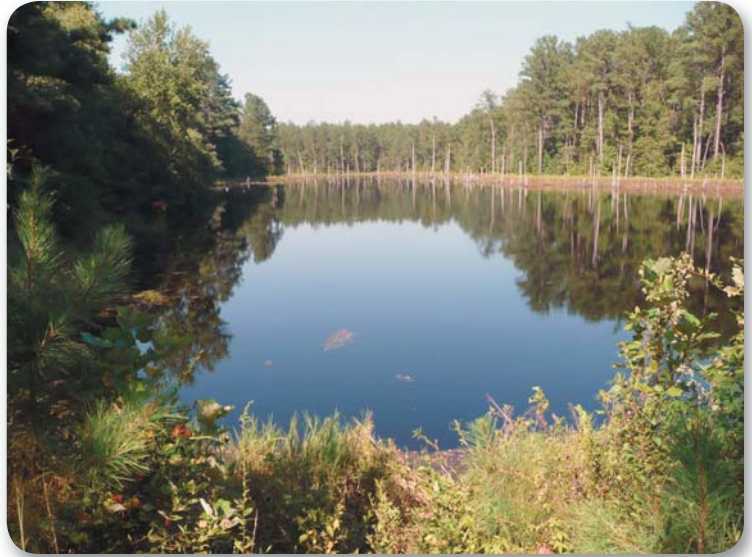
A ponds on the property

The Hogan farm conservation easement is a working lands easement whereby the intent of the protection effort is to keep the land in operation in perpetuity ensuring a revenue stream for the present landowner and future generations. The land is currently being farmed in high-quality coastal Bermuda hay production with a working forest