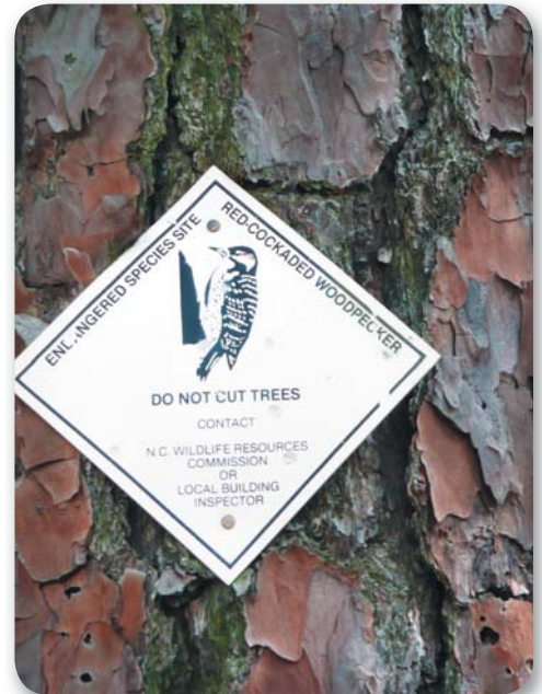
Coastal Bermuda Hayfields