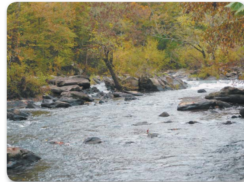
Deep River – Johnson’s Ford/Buzzard Rock complex

is the premier white water recreational site on the river making it a high priority protection area for the newly authorized unit of the North Carolina State Parks System – the Deep River State Trail.